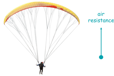
Parachutes have a large surface area which increases air resistance, slowing the parachute down.

Air resistance: A type of friction force that pulls against an object travelling through the air. Some objects are more 'streamlined', meaning that the air pulls on them less, and they travel faster.