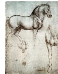
Leonardo Di Vinci