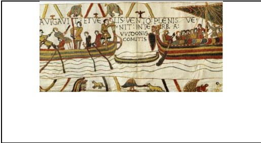
Here is William, Duke of Normandy starting his invasion of England.