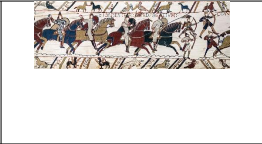
Several scenes on the tapestry show the battle.