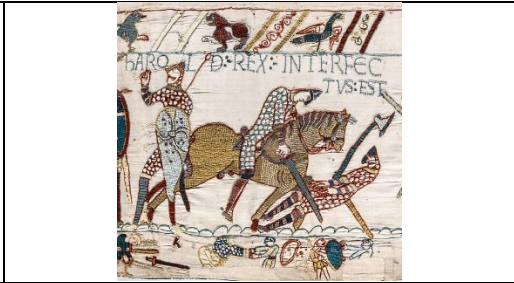
Harold is shot in the eye with an arrow and dies.