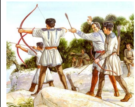
Late Roman infantry practicing archery