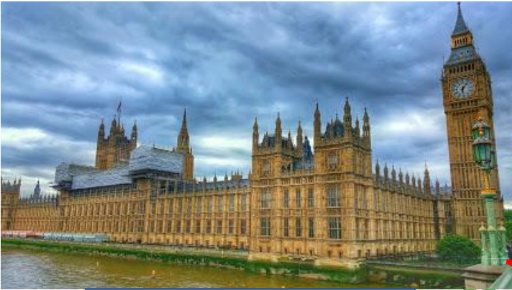
Houses of Parliament and Big Ben