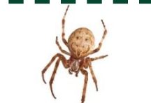
e.g. spiders and scorpions