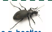
e.g. beetles, ants, flies, bees (and more!)