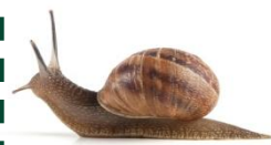
e.g. slugs and snails