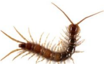
e.g. centipedes and millipedes